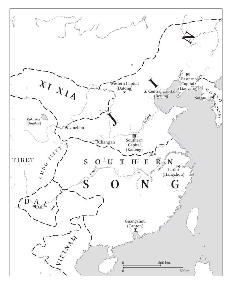
MAP 2 Map of China ca. 1200 showing the Jin, Xi Xia, Southern Song, Tibet, and Dali (after: Frederick Mote, Imperial China: 900–1800, Map 10, circuits of Southern Song and Jin).